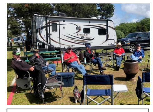
Guess the women must be off doing all the work (hee hee)! Actually, they went to BINGO at the VFW!